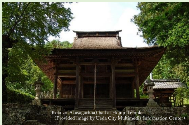
Kokuzo(Akasagarbha) hall at Hojuji Temple

We will guide you around temples in Ueda City and view Buddhist statues during this bus tour.