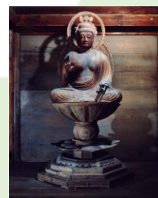
Seated Yakushi Nyorai(Bhaisajyaguru) [Chuzenji Temple]